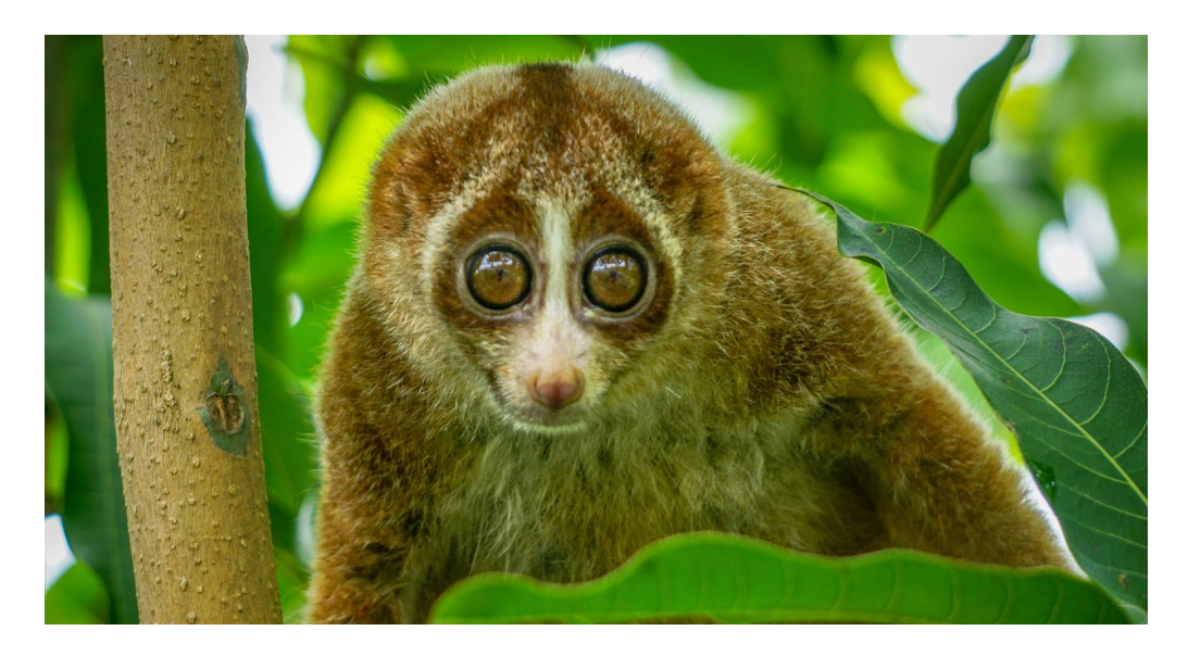
Image of a Slow Loris in the wild. A primate originating in South East Asia with a rare toxic bite after which the DDoS Attack is named

A "low-and-slow" attack vector, it has the goal of saturating the entire TCP stack for the HTTP/S daemon. These attacks are harder to detect because they do not need the volume of resources required for other types of attack. They enable a single attacker to take down a web server without affecting other ports or services on the targeted network. SlowLoris sends HTTP headers at certain intervals combined with partial requests, which opens connections to the target machine and keeps them open, eventually overflowing the maximum concurrent connection volume, preventing legitimate clients from accessing the server.